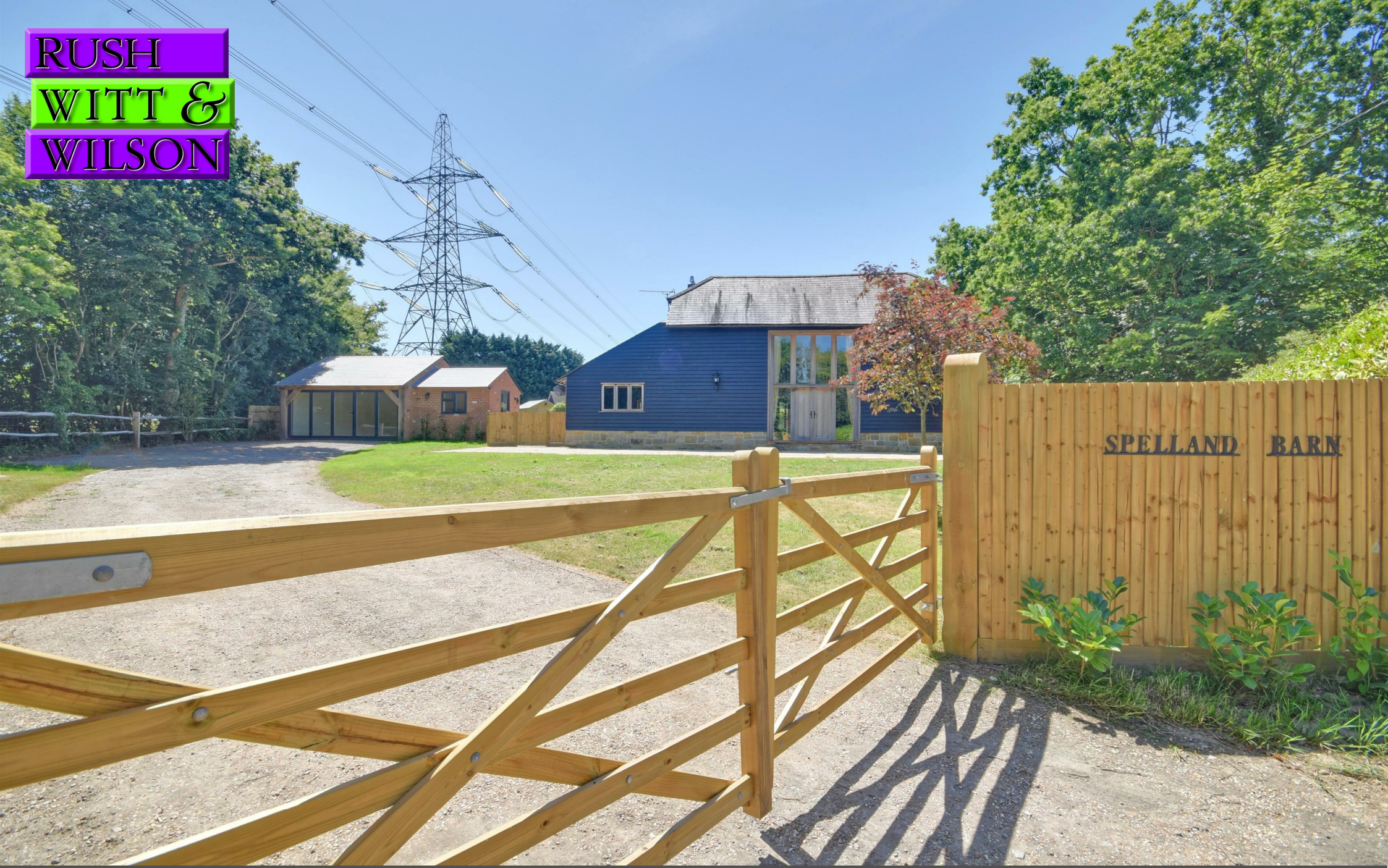
Spelland Barn, Goatham Lane, Broad Oak, East Sussex, TN31 6EY. £825,000 - £850,000 Guide Price